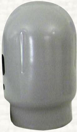
Caps Painted Gray 6 1/2" – 3 1/8-11