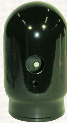
Caps Painted Black 6 1/2" – 3 1/8-11