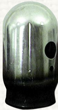
Caps Unpainted 6 1/2" – 3 1/8-11