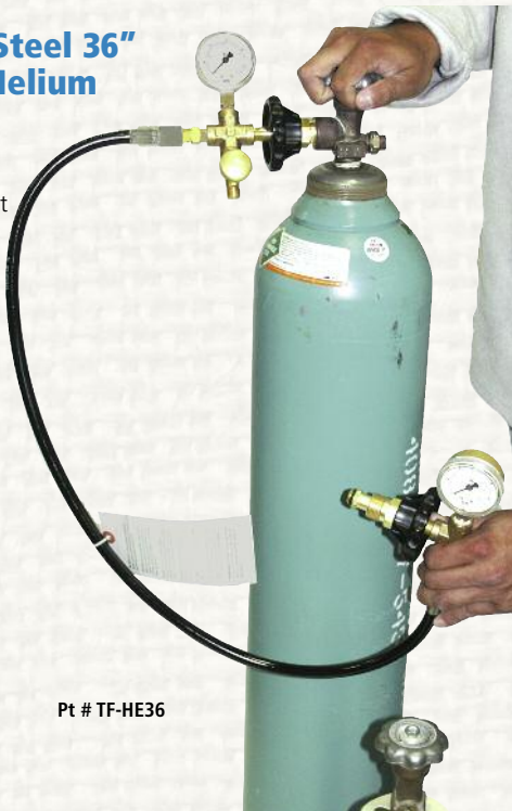
Pt # TF-HE36