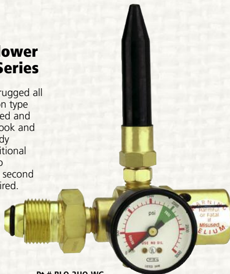
Pt # BLO-3HO-WG

Balloon Blower rugged all brass body, Piston type mechanism, drilled and tapped for tie hook and string cutter. Body contains an additional 1/4" NPT port to accommodate a second filler valve if desired.