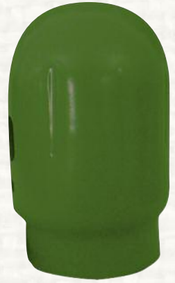
Caps Painted Green Medical 6 1/2" – 3 1/8-11