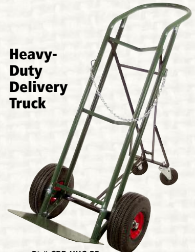
Heavy-Duty Delivery Truck

See our complete line of Carts & Stands in Section 17A