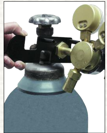
Use as a Captured Wrench – No more searching for a wrench.

See our Complete line of Wrenches and Sockets on page 11A 4-6