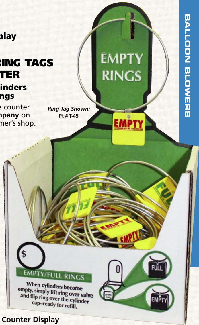
Counter Display Pt # D1

Great P.O.P. item for your retail locations. Artwork available for your sales flyers.