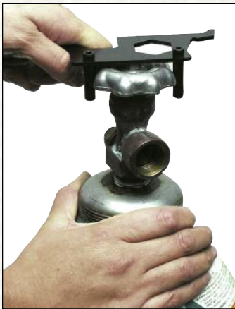
Use for Tough to Open Valves Pt # RAT-CW540580