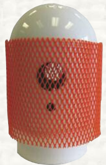
Acetylene Cap Pt # CAP-ACT4PK100