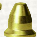
Pt # BLO-RT-3