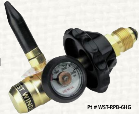
Pt # WST-RPB-6HG