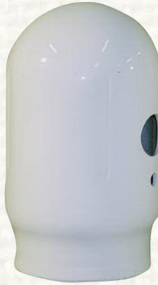
Caps Painted White 6 1/2" – 3 1/8-11