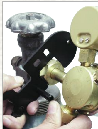
Connecting Regulator CGA 540 & CGA 580