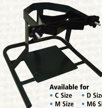
Large Single Cylinder Stand