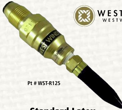
Pt # WST-R125