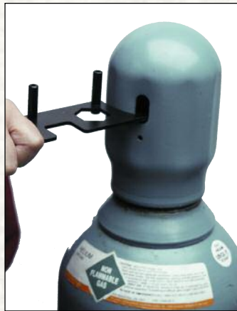
For Hard to Turn Caps