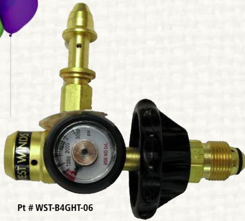
Pt # WST-B4GHT-06