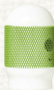
High Pressure Cap Pt # CAP-G4PK100