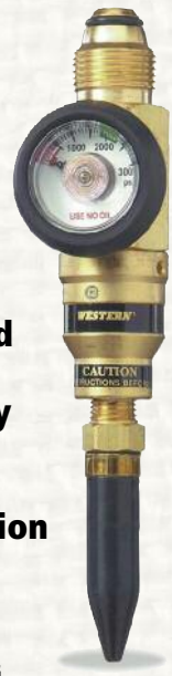
Pt # WST-R125G