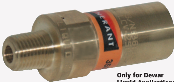
Only for Dewar Liquid Applications.

Generant Liquid Cylinder Pressure Control / Relief Valve is designed exclusively for use on DOT 4L Cryogenic Liquid Cylinders. Dramatically reduces the NOISE associated with traditional cylinder relief device discharge. Under normal operating conditions it optimizes cylinder performance by venting only what is required to maintain cylinder pressure in a tight band. In the event that circumstances demand, it has adequate flow capacity to ensure safety, meeting all industry and regulatory requirements.